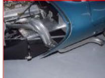
BTM fabricated the custom...