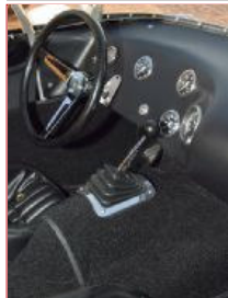
A Bell-style Moon steering...