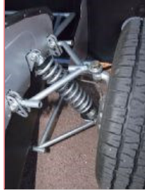
Adjustable A-arms and QA1...