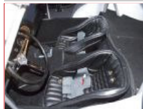
Racing bucket seats with five-point...