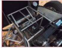
A Harrison aluminum radiator,...