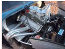
A Chevrolet ZZ4 with aluminum...