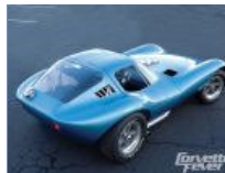
Compact yet curvaceous body...